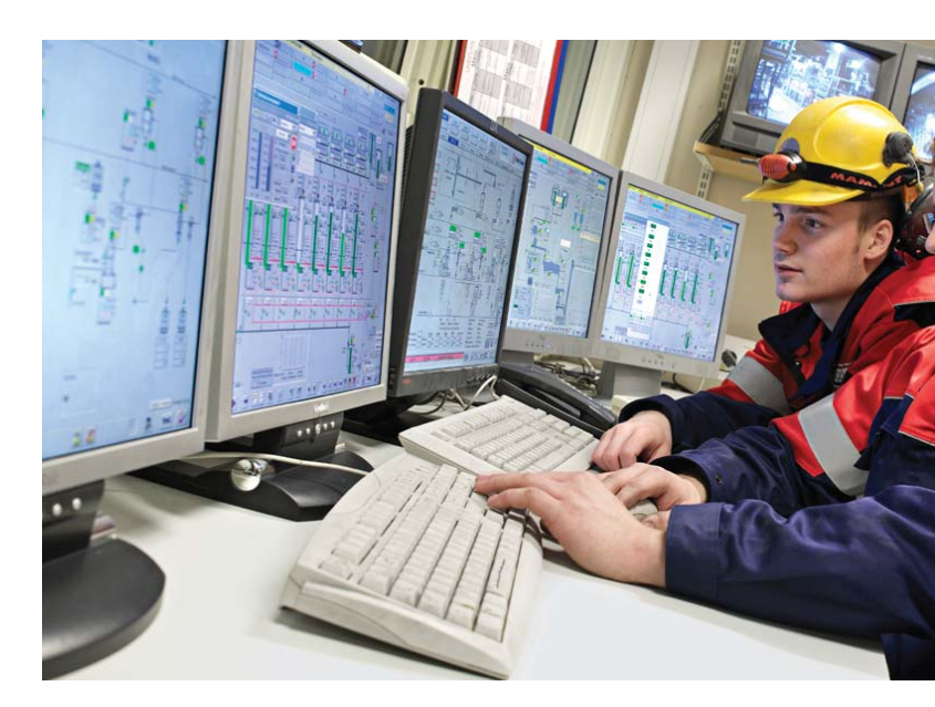
Computer control of micro grit processing lines, using real time data to check for quality and consistency in the end product.

Quality control, in both the furnace and processing plant, is an integrated part of our production process. Chemistry, size distribution, surface area, bulk density, grain shape, abrasive efficiency and other relevant parameters are carefully measured and monitored to maintain close control of production, and to ensure the superior quality of the product.