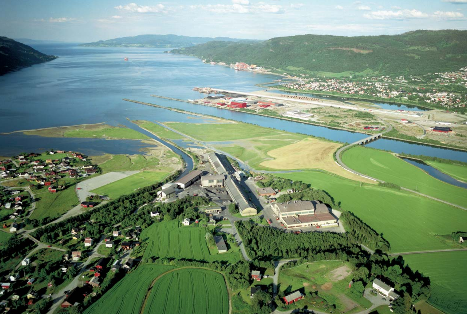
Washington Mills AS is dedicated to growing its business and respecting the community and the environment in which it operates.